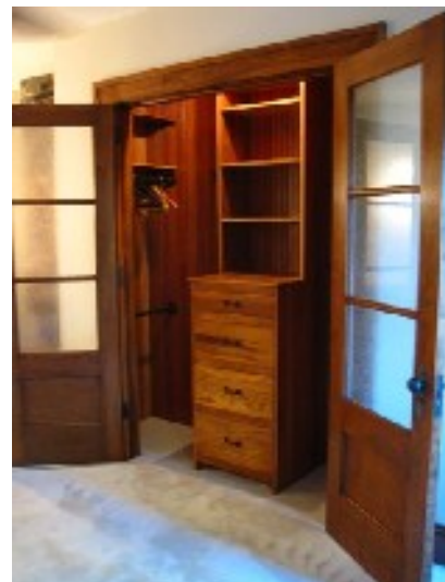
The two bedrooms feature closets with built-in wood cabinets.