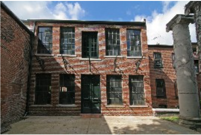
Rear of the main stable building features large steel windows.