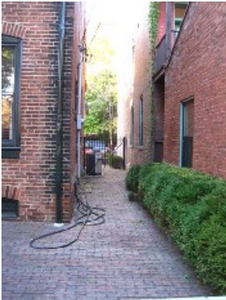
Side court with gated passageway.