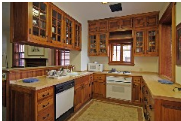
The kitchen has custom wooden cabinets with antique hardware.

These buildings are offered at $650,000. Will consider separation. Shown by appointment only. Contact: 314-963-3477 or lg@buildingmuseum.org .