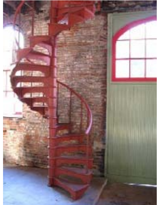
Cast iron spiral stair in front stable building.