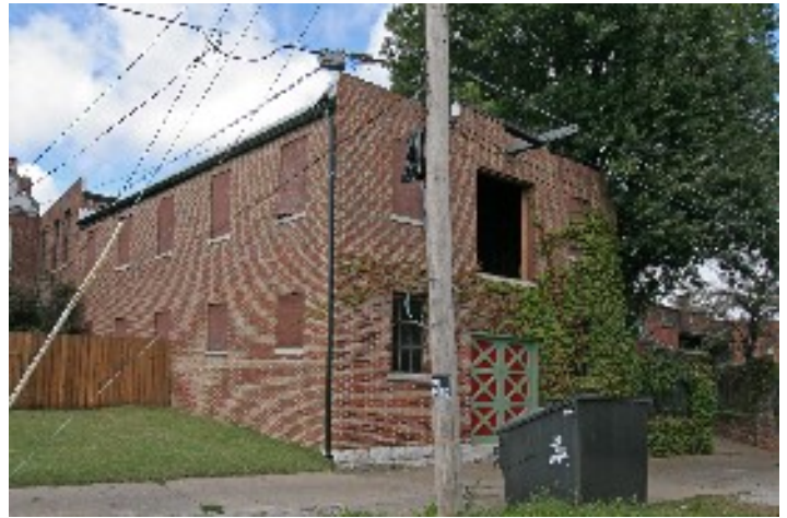
The rear stable building viewed from the alley.