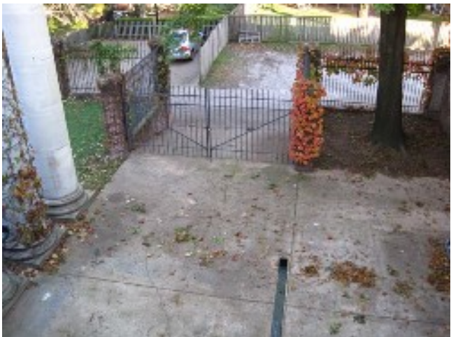
View from second story balcony entrance at rear of front stable building.