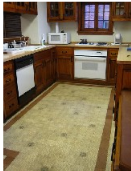
Among numerous unique features, the kitchen floor features original encaustic tile from the Gothic Corridor of Union Station.