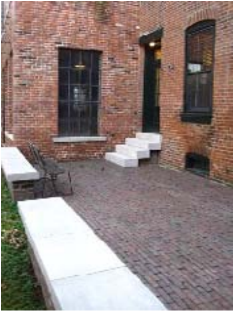
The rear courtyard has brick paving and a stone-capped wall.