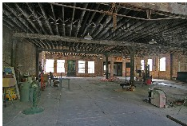
A view of the first floor of the front stable building.