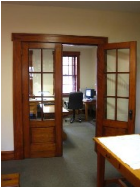
View into the first floor front room showing the home's fine millwork.