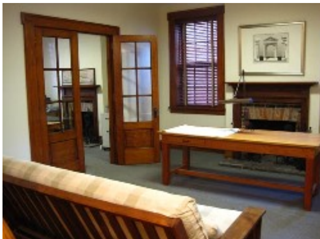
Dining room on the first floor; with antique mantle.