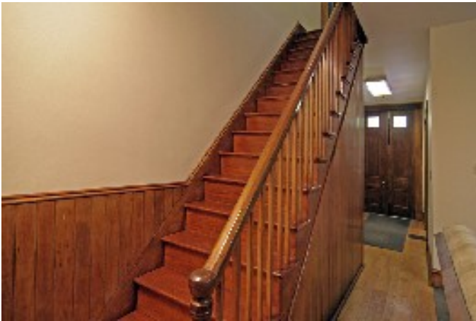
The staircase in the house retains its historic balustrade.